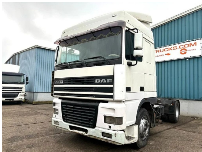
DAF 95.380 XF SPACECAB (EURO 2 (MECHANICAL ... 4x2 Referentienummer: SN 56068266 Z