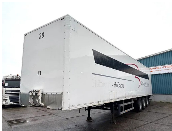
Pacton / JUMBO 3-AXLE CLOSED BOX WITH FULL STEEL ...