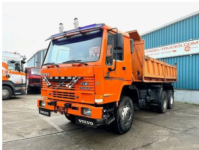
Volvo FL 12.380 6x6 FULL STEEL SUSPENSION MEILLER K... Referentienummer: SN 53819343