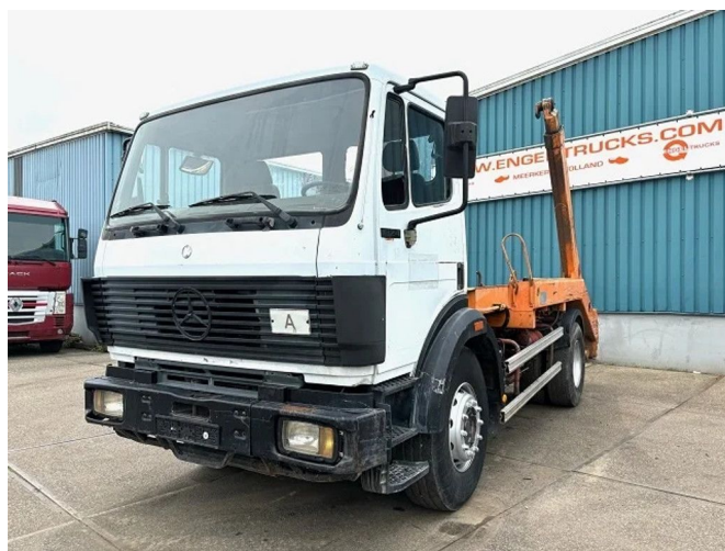
Mercedes-Benz SK 1824 K 4x2 FULL STEEL CHASSIS WITH...