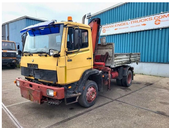
Mercedes-Benz 1117 K (6-CILINDER) KIPPER WITH F... 4x2 Referentienummer: SN 56826116